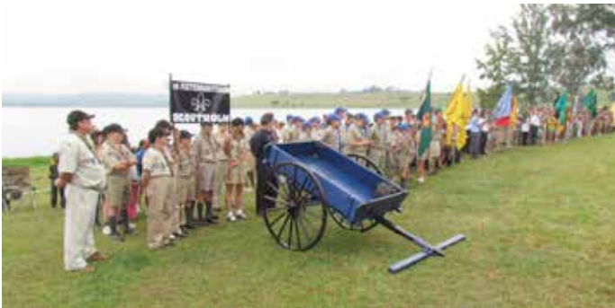
3rd Pietermaritzburg form up on parade with their traditional scout trek cart.